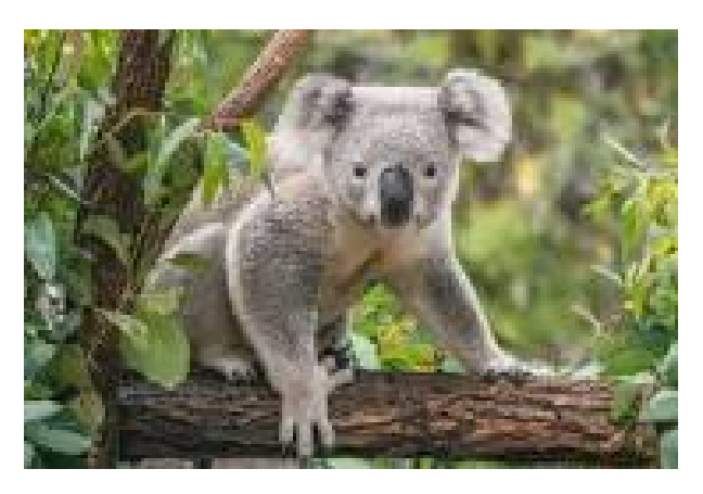
Will I see you at SCM24 in Brisbane Next September?