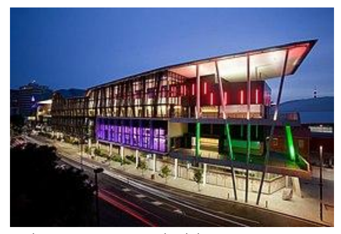
Brisbane Convention and Exhibition Centre